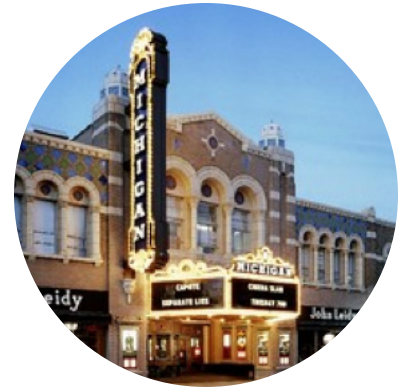
Liberty Street in downtown Ann Arbor

Ann Arbor is the largest city near the York Technical Center campus. The York facility is located in York Township, about 10 miles south of Ann Arbor. Ann Arbor is eight miles west of Ypsilanti, 42 miles west of Detroit and 32 miles from the Detroit Metropolitan Wayne County Airport. This information focuses on Ann Arbor, but also provides information about the surrounding towns and rural areas.