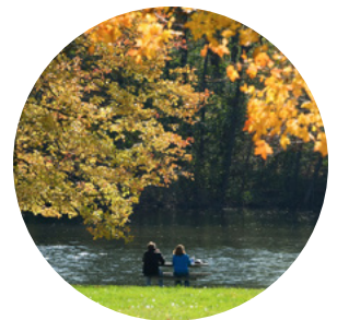
Bandemer Park in Ann Arbor