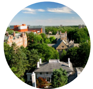
Rooftop view of the University of Michigan