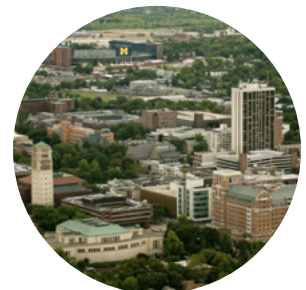
Aerial view of Ann Arbor

Note: All links can be accessed from OneToyotaHub.com once the portal is live.