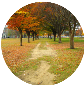
Burns Park Neighborhood, Ann Arbor

*From visitannarbor.org , weatherspark.org and the U.S. Census