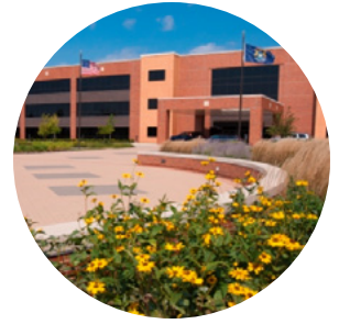
York Toyota Technical Center