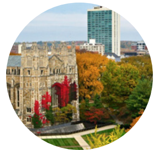
University of Michigan