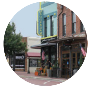
Old Downtown Plano