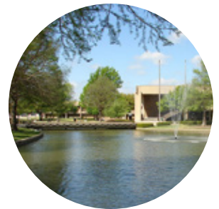
Plano Senior High School