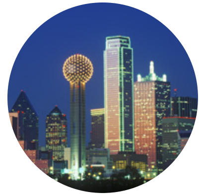
Dallas skyline at night

Dallas is the ninth largest city in the United States, third largest in the state of Texas, and is the economic center of the Dallas-Fort Worth Metroplex. Plano, one of northern suburbs of Dallas, is 20 miles north of downtown Dallas and 30 miles from the Dallas/Fort Worth International Airport. This information focuses on Plano, but also provides some information about the Dallas Metroplex.