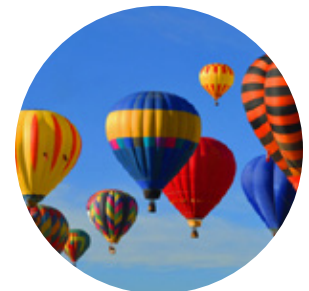
Plano Balloon Festival

Note: All links can be accessed from OneToyotaHub.com .